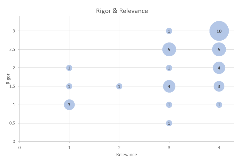
Figure 2. Mapping of selected papers with respect to rigor and relevance